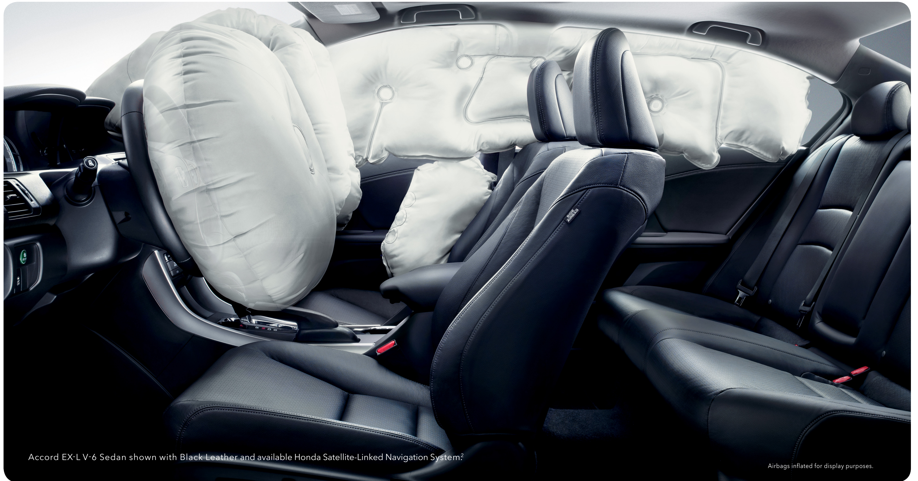
Accord EX-L V-6 Sedan shown with Black Leather and available Honda Satellite-Linked Navigation System. 2