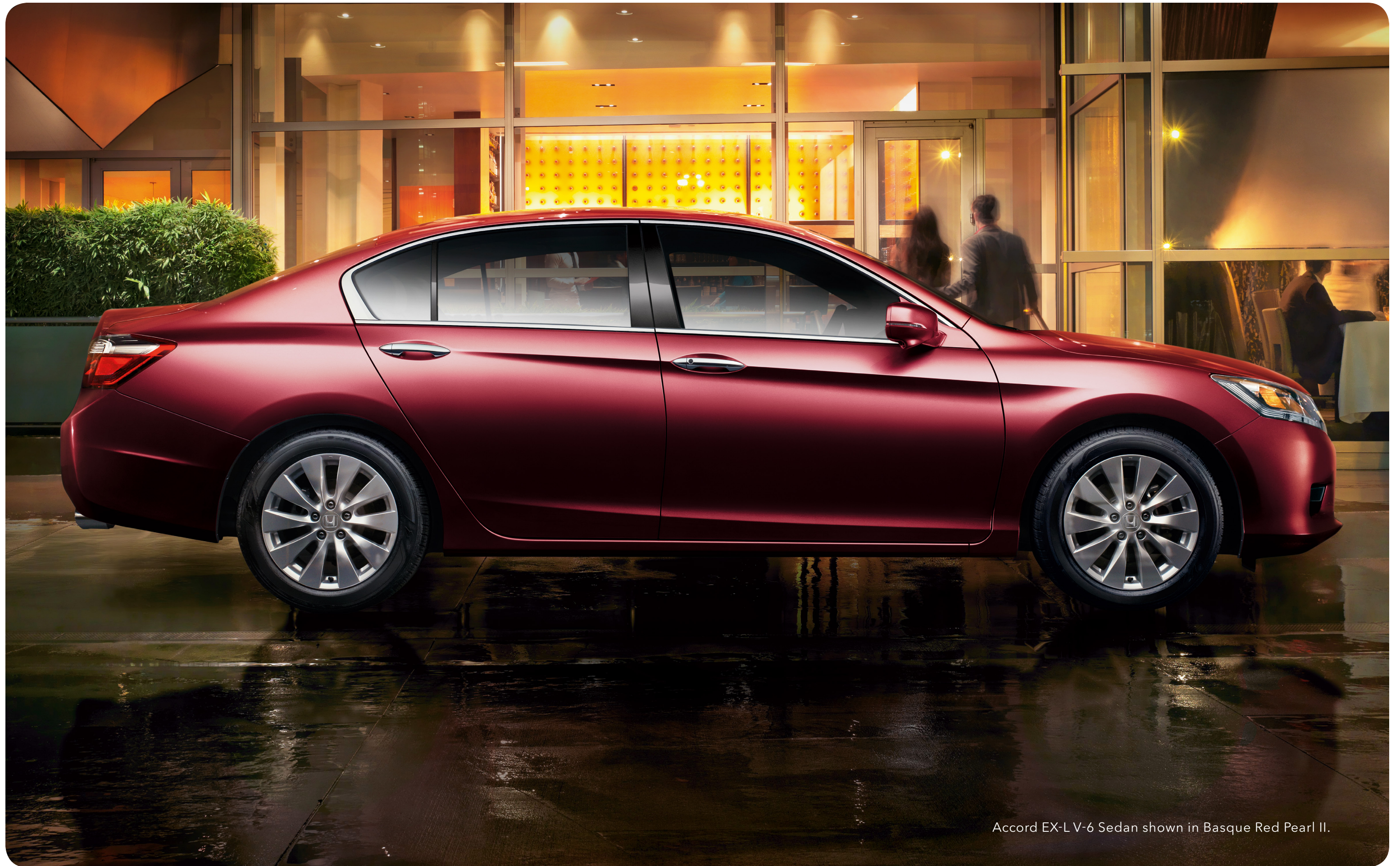
Accord EX-L V-6 Sedan shown in Basque Red Pearl II.