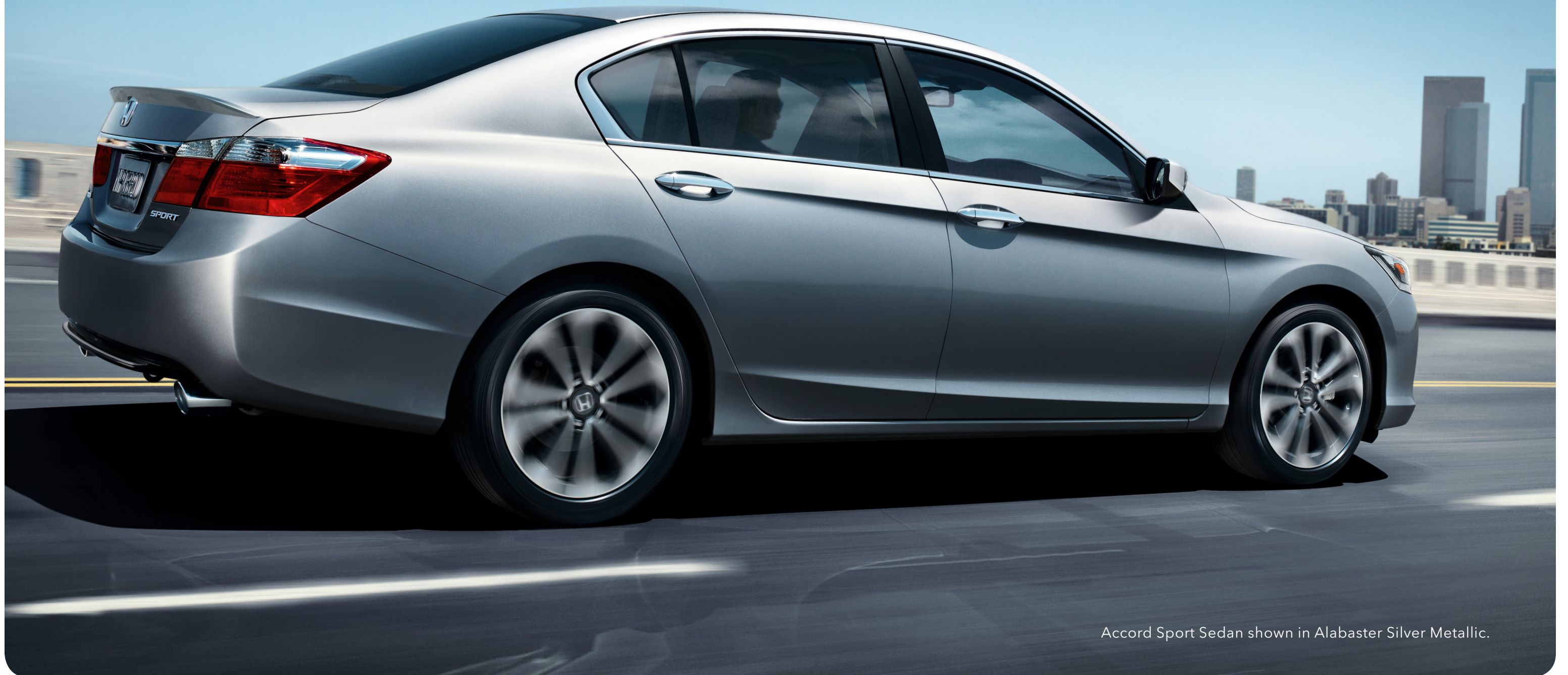
Accord Sport Sedan shown in Alabaster Silver Metallic.

How about an Accord with a little more attitude? Discover the Accord Sport Sedan. It features all the little details you love that make a big difference on the road. Like 18-inch alloy wheels, fog lights, a decklid spoiler and a dual exhaust system. On the inside, paddle shifters (with CVT) and a 10-way power driver's seat make any drive that much better.