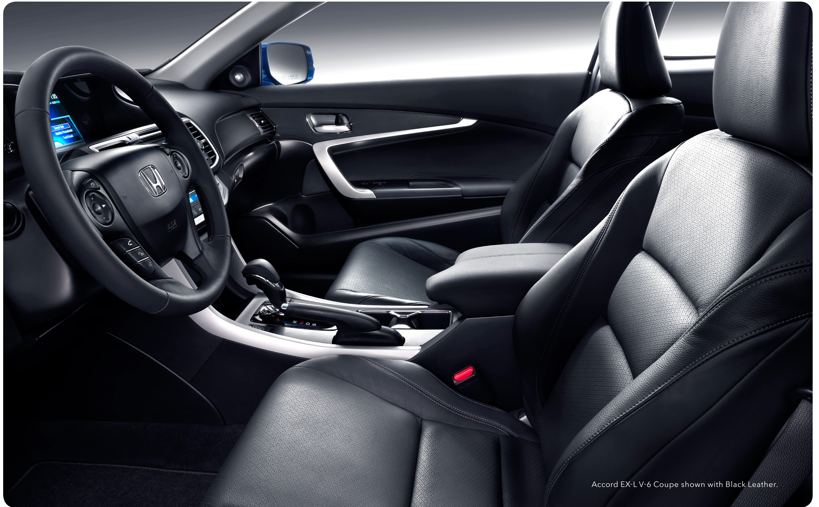
Accord EX-L V-6 Coupe shown with Black Leather.