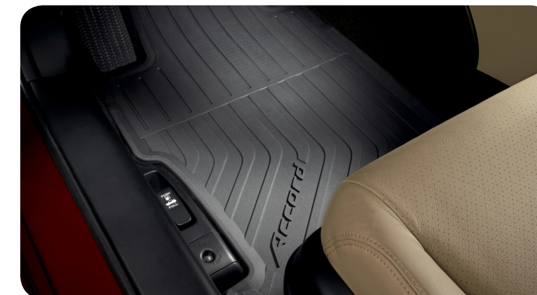
ALL-SEASON FLOOR MATS