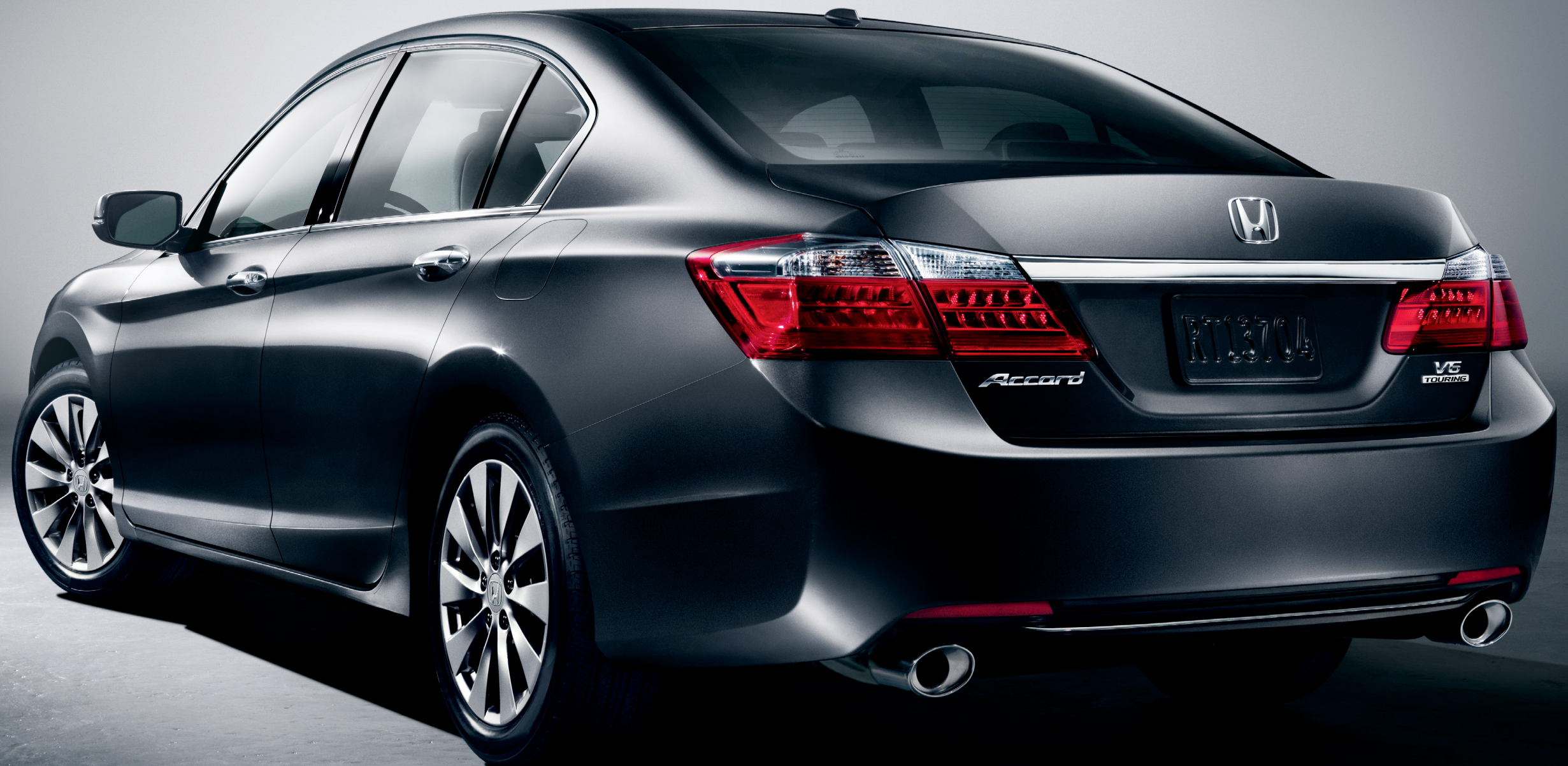
Accord Touring Sedan shown in Modern Steel Metallic.