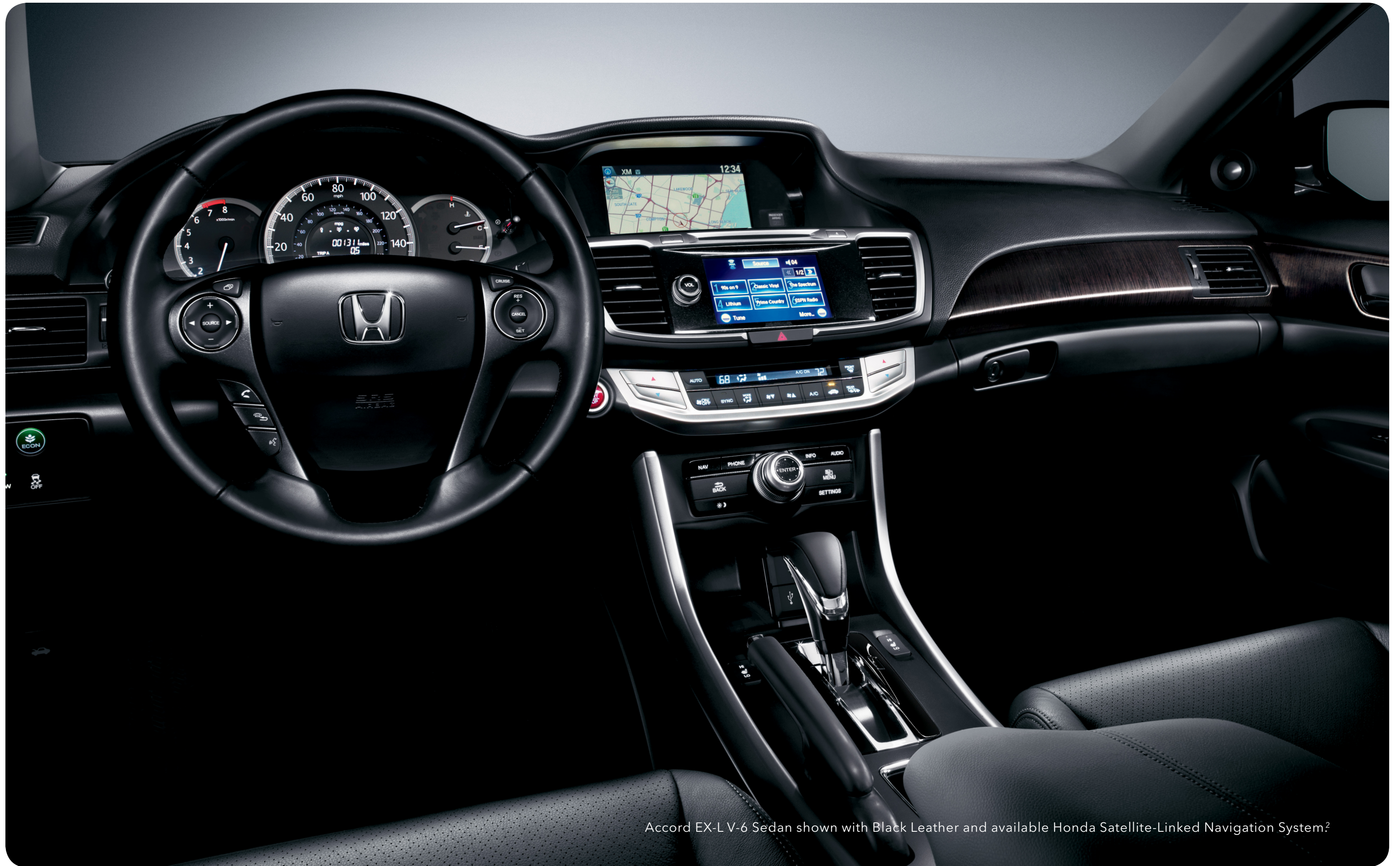
Accord EX-L V-6 Sedan shown with Black Leather and available Honda Satellite-Linked Navigation System. 2