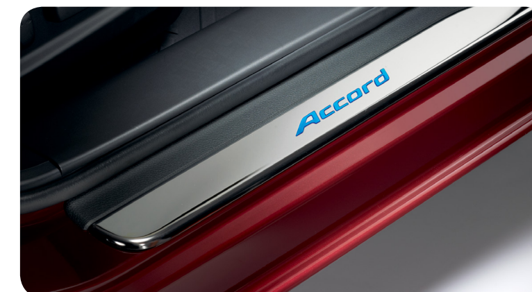
ILLUMINATED DOOR SILL TRIM