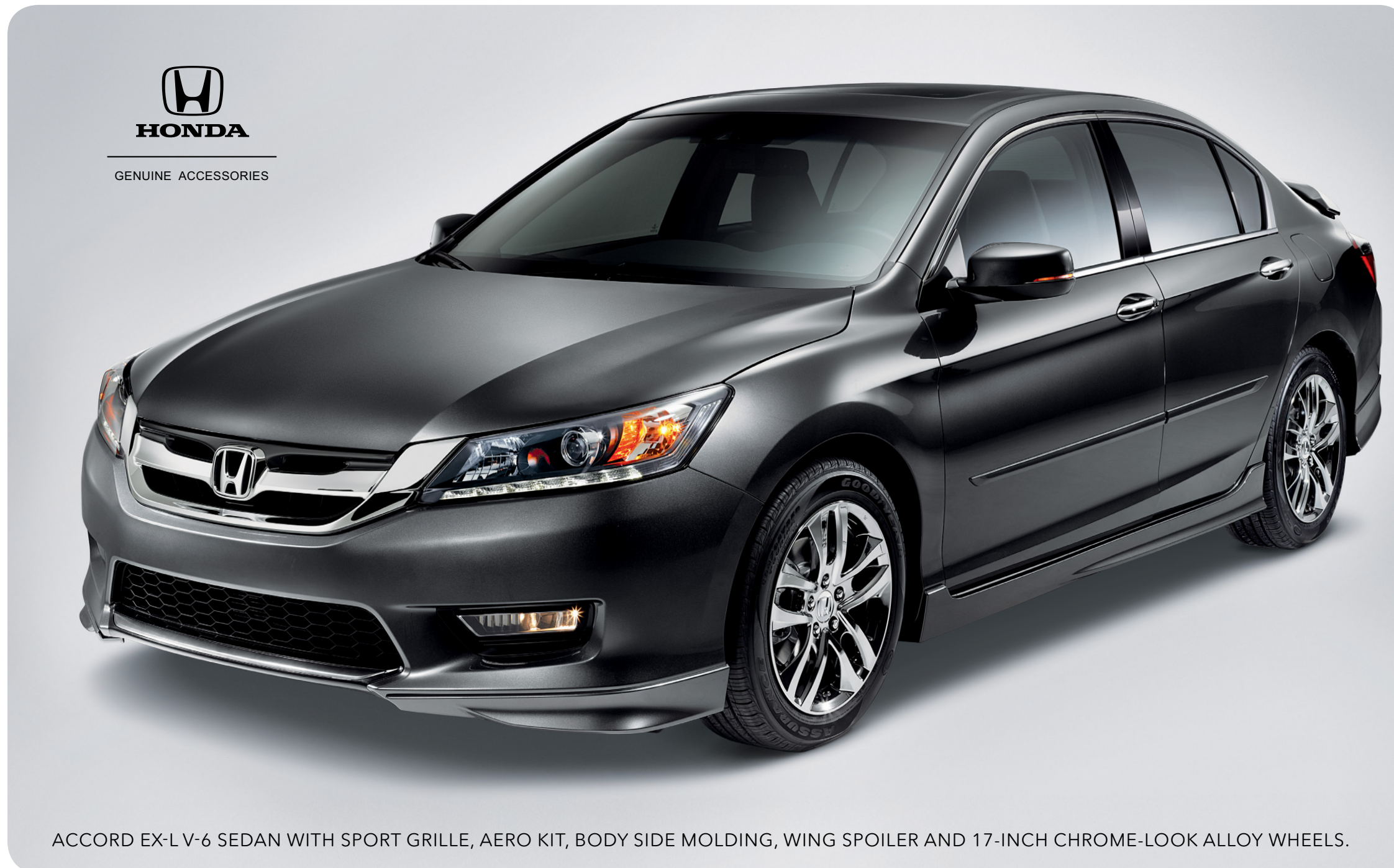
ACCORD EX-L V-6 SEDAN WITH SPORT GRILLE, AERO KIT, BODY SIDE MOLDING, WING SPOILER AND 17-INCH CHROME-LOOK ALLOY WHEELS.

Manufactured to the same strict standards as Honda vehicles, Honda Genuine Accessories are the perfect way to personalize and protect your vehicle. Please see your Honda dealer for details.