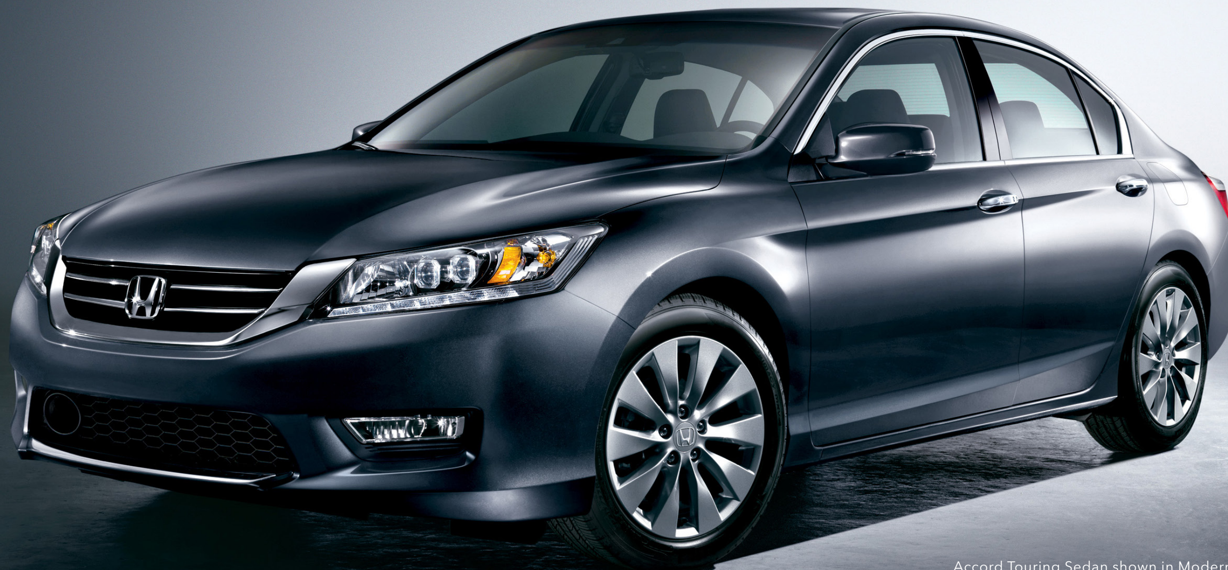
Accord Touring Sedan shown in Modern Steel Metallic.

When does a car become more than just a car? That question has inspired us from the beginning, and for over three decades, the Accord has been our answer. Now in its ninth generation, our signature vehicle continues to evolve with drivers and all of their humanity in mind. And the relationship between an Accord and its owner continues to be something very special.